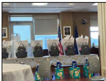
Shower gifts given to the expectant moms. The laundry baskets and diaper bags were filled with items.