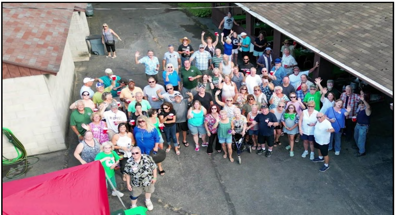
Aerial photo, taken by drone, of the happy crowd at last summer's North Albany Reunion hosted by the Limericks.