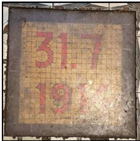
The tile on the floor inside the Café du Croissant reading "31.7.1914," being the exact spot Jaures was shot dead.