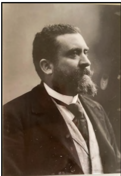
Jean Jaures, 1859-1914