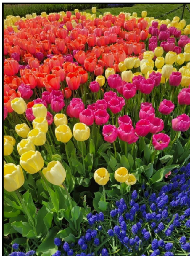
A big bed of "Purdy Colorblend" tulips edged with purple grape hyacinths.